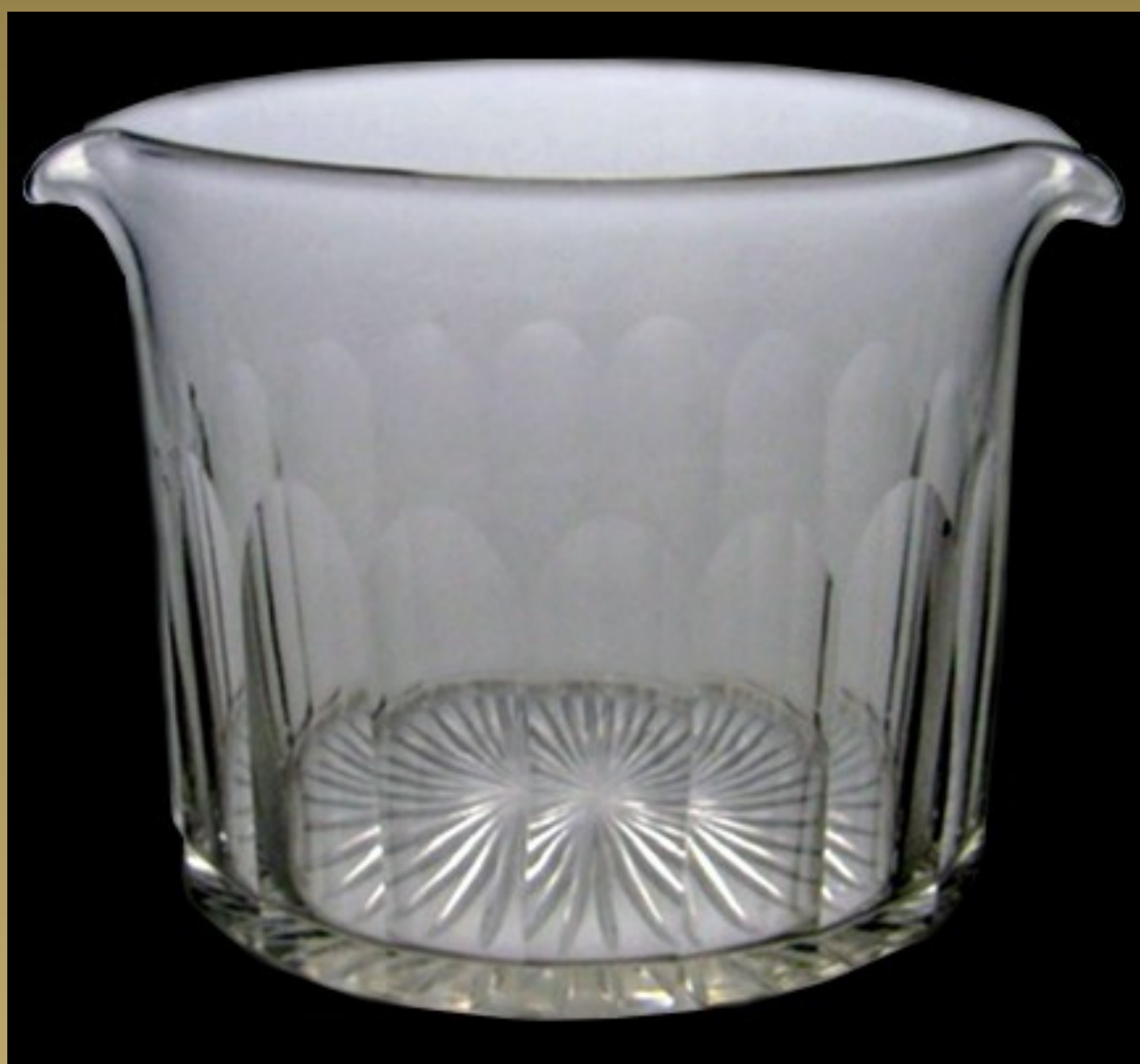
Figure 2. A circa 1820 British example of a wine rinser. This vessel is just over 3.5" in height.

This three-inch tall vessel has been identified as a wine rinser. Wine rinsers or coolers were used to cleanse wine glasses between dinner wine courses. The diner would invert the wine glass into the rinser, which was partially filled with water. The Oxon Hill example is missing the two everted lips along the rim (Figure 2), where the diner would place the stem of the wine glass. By twirling the glass in the lip groove, the bowl of the glass rotates inside the rinser, washing away all traces of the previous wine (Figure 3).