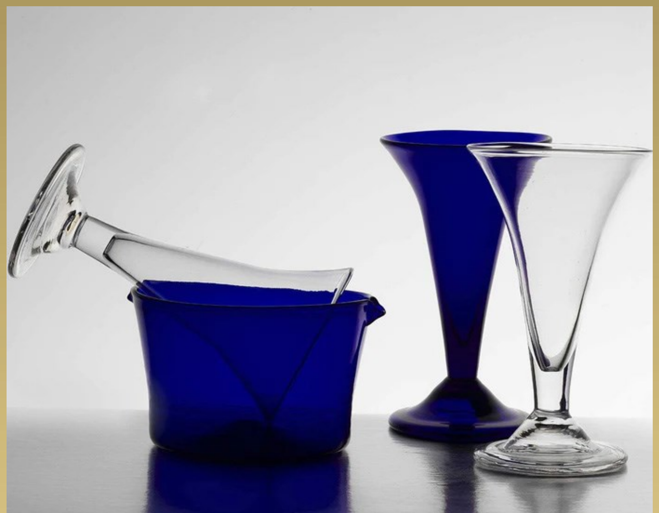
Figure 3. Replica wine rinsers sold at Mount Vernon.

The title of this Curator's Choice is a quote from André Simon, a French-born wine merchant who wrote prolifically about wine.